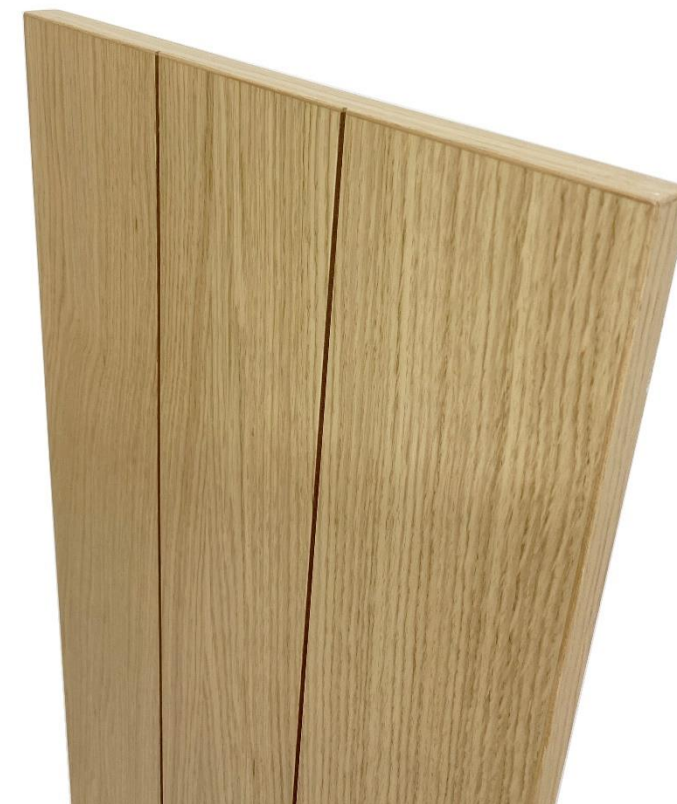
T&G Décor End