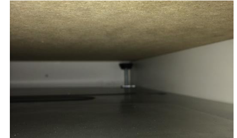
Anti-tip bracket fitted