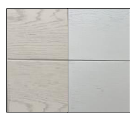
Pre finished Linear