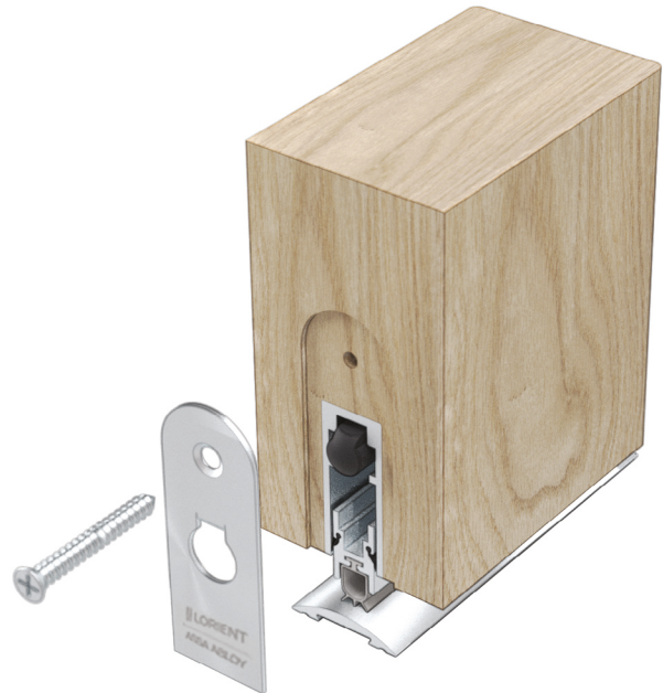
LAS8001 si (shown with LAS4001)